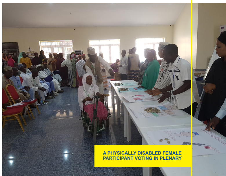
A PHYSICALLY DISABLED FEMALE PARTICIPANT VOTING IN PLENARY