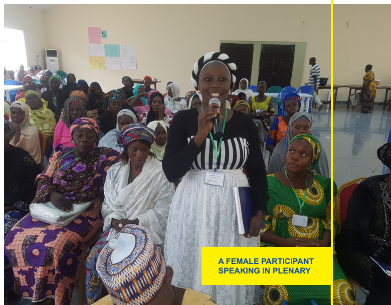
A FEMALE PARTICIPANT SPEAKING IN PLENARY

The tangible results of the Lokuwa ward CDP process and especially the CDP session is this Ward Development Plan. This Plan and its content were validated by the representatives of the Lokuwa ward.