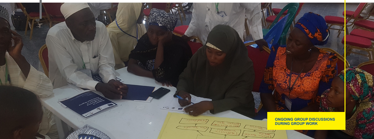
ONGOING GROUP DISCUSSIONS DURING GROUP WORK