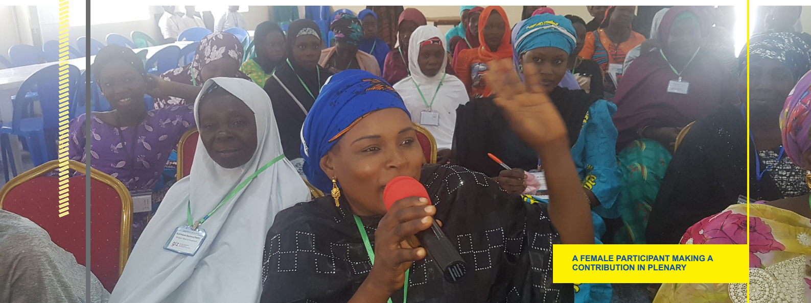
A FEMALE PARTICIPANT MAKING A CONTRIBUTION IN PLENARY