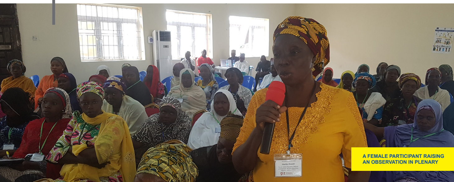
A FEMALE PARTICIPANT RAISING AN OBSERVATION IN PLENARY