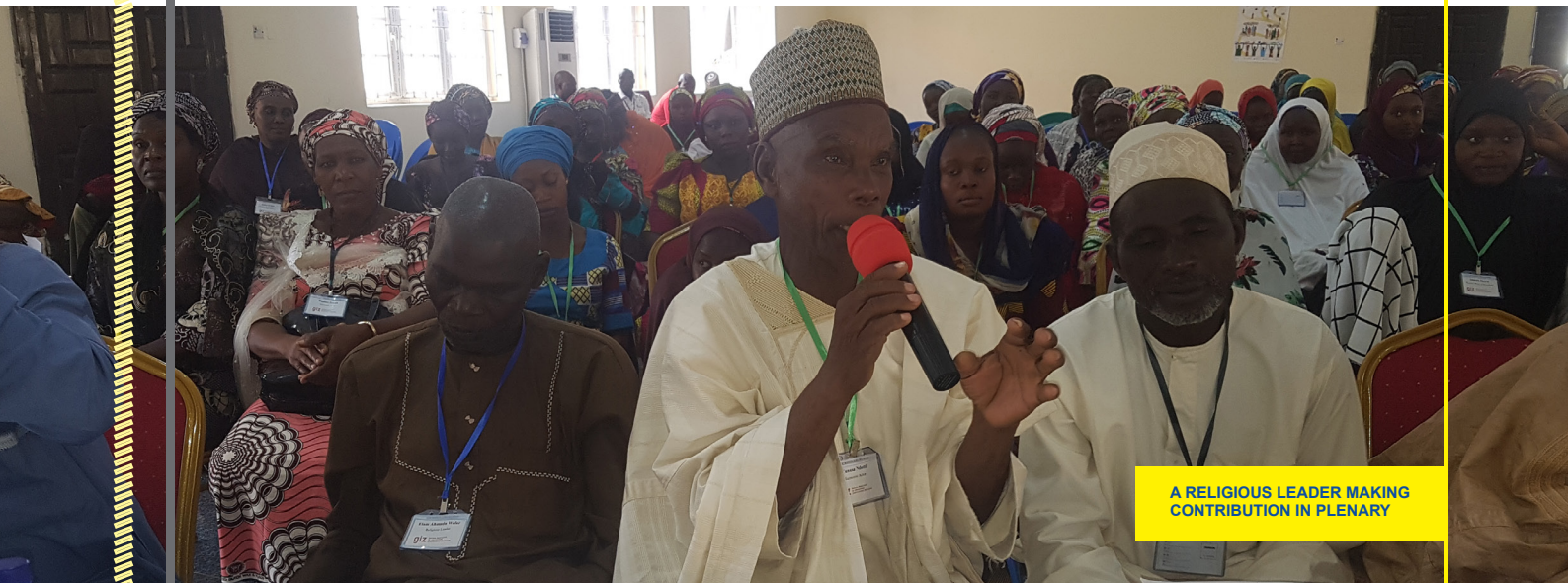
A RELIGIOUS LEADER MAKING CONTRIBUTION IN PLENARY