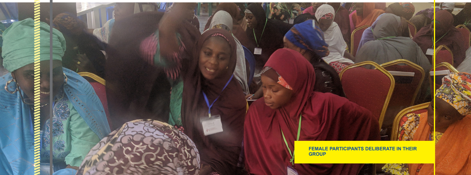
FEMALE PARTICIPANTS DELIBERATE IN THEIR GROUP