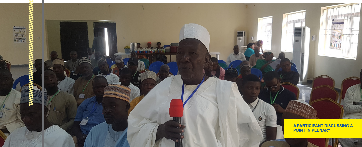
A PARTICIPANT DISCUSSING A POINT IN PLENARY