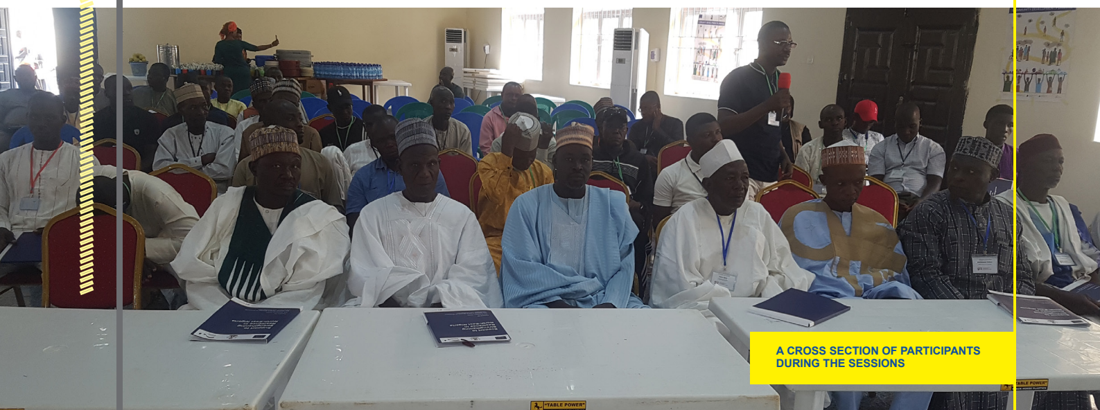
A CROSS SECTION OF PARTICIPANTS DURING THE SESSIONS