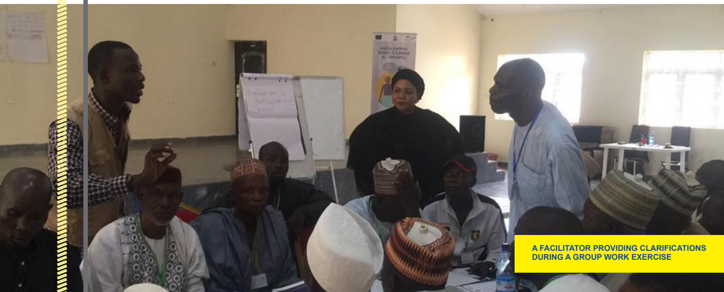
A FACILITATOR PROVIDING CLARIFICATIONS DURING A GROUP WORK EXERCISE