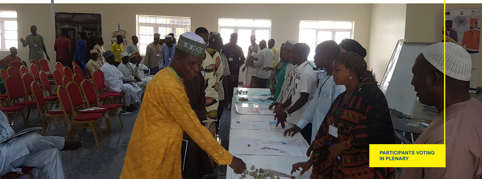
PARTICIPANTS VOTING IN PLENARY